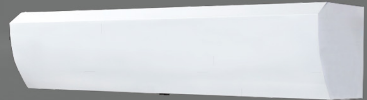
CODE: EAC AIR CURTAIN - METAL BODY WITH 21 M/S AIR PRESSURE