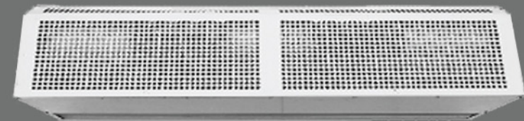
CODE: EIA INDUSTRIAL AIR CURTAIN - METAL BODY EFFECTIVE UPTO 6-8 METER HEIGHT

01 Cooling Retention Effects Prevents cold air to go outside & hot air to come inside