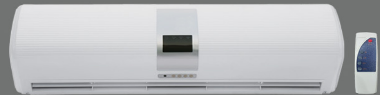
CODE: ABE (With Remote / In Built Sensor) AIR CURTAIN - PLASTIC BODY WITH 21 M/S AIR PRESSURE